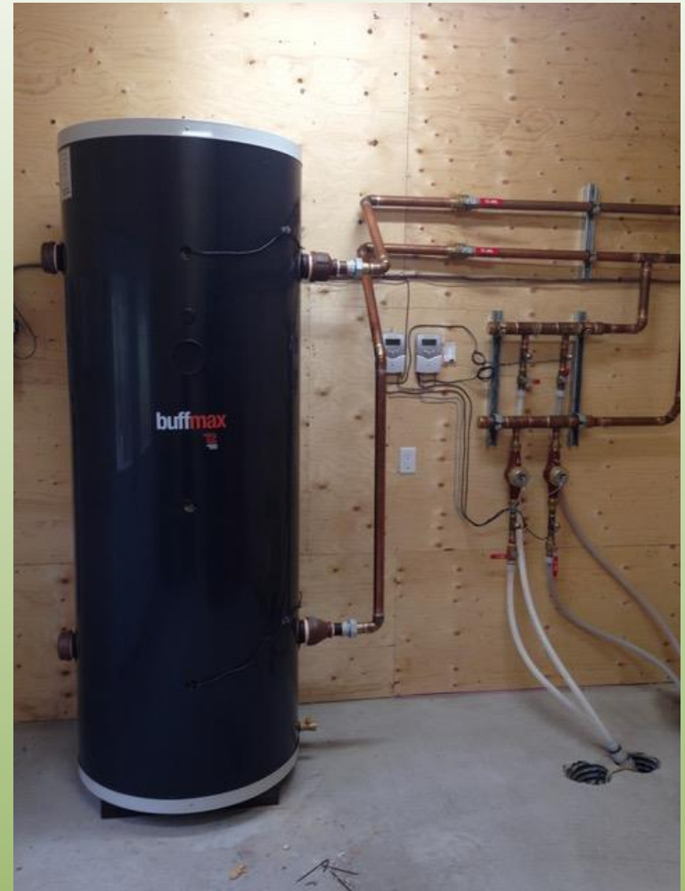
750L buffer tank (Buffmax)