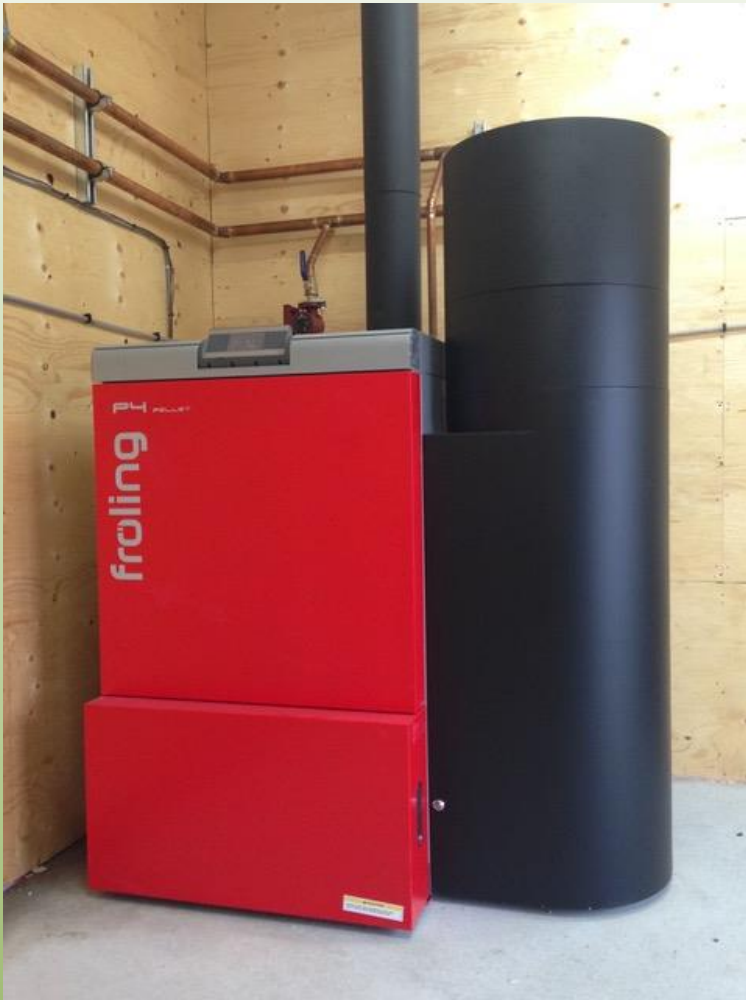
Froling P4 38 kW wood pellet boiler